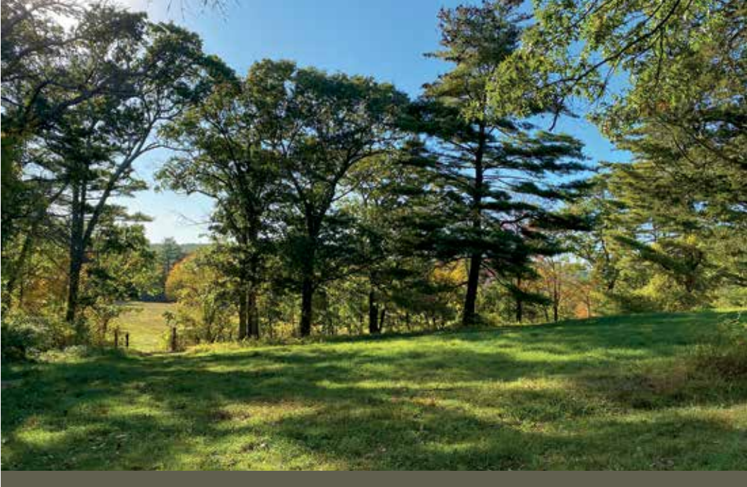
GREENBELT CONSERVATION CHRONICLE Kamon Farm Conservation Area | IPSWICH

DO YOU HAVE A CONSERVATION VISION FOR YOUR LAND? GREENBELT CAN HELP.