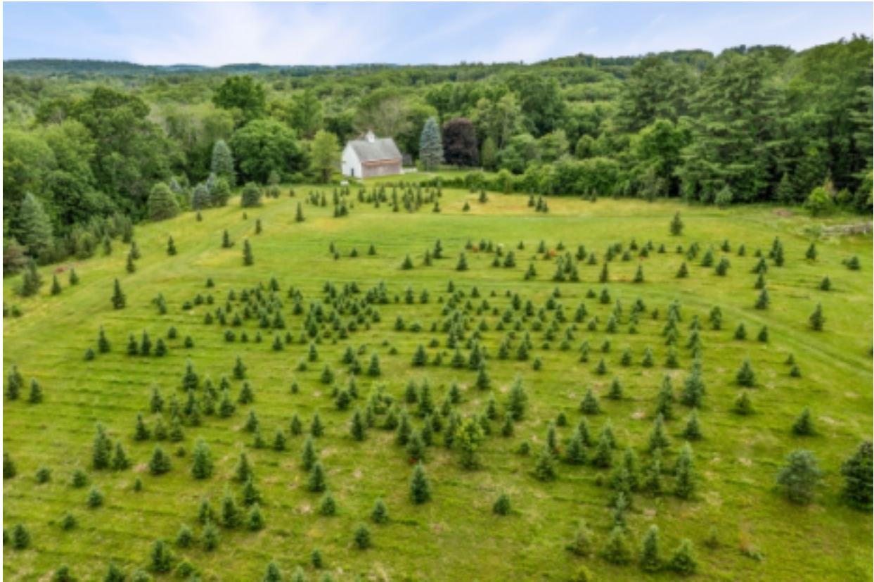
Evergreen Farm, West Newbury