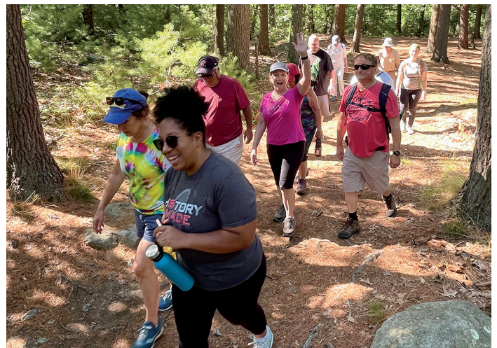
Greenbelt and friends have enjoyed multiple walks at Lynn Woods