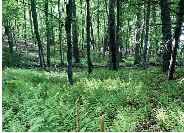
NEIL UNGERLEIDER (2)