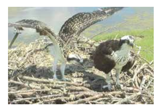
VIRTUAL OSPREY STORY MAP Monitoring, research, tagging, migration and more. ecga.org/osprey-program

OSPREYCAM Thousands of viewers enjoyed watching the fledgling "River" via Greenbelt's live OspreyCam near Gloucester's LobstaLand. Many thanks to the folks at LobstaLand for "hosting" the webcam there.