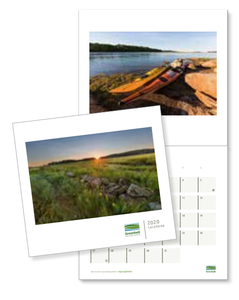
12 months of spectacular Jerry Monkman photography taken exclusively for Greenbelt over the years!

Considering a gift of stock? Contact Cathy. ccl@ecga.org, 978 768 7241 x13