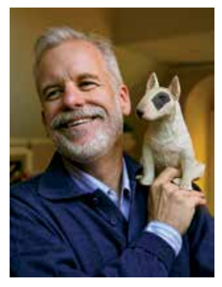
April 25, 10:00am ecga.org/events Registration required