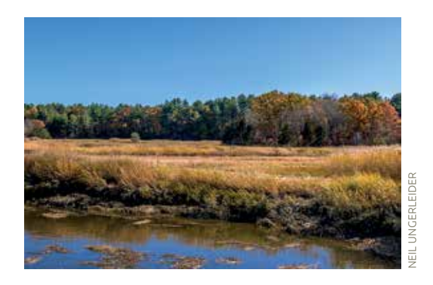
HELP CONSERVE THESE NATURAL PLACES ecga.org/cavanaughcreed

On Orchard Street, Greenbelt is working with the Creed family to preserve 15 acres that would become a new Greenbelt reservation, with a trail leading to a scenic overlook of the Parker River.