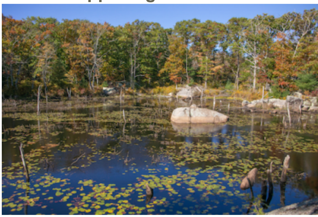
West Gloucester's Great Ledge & Bray Street - Success!