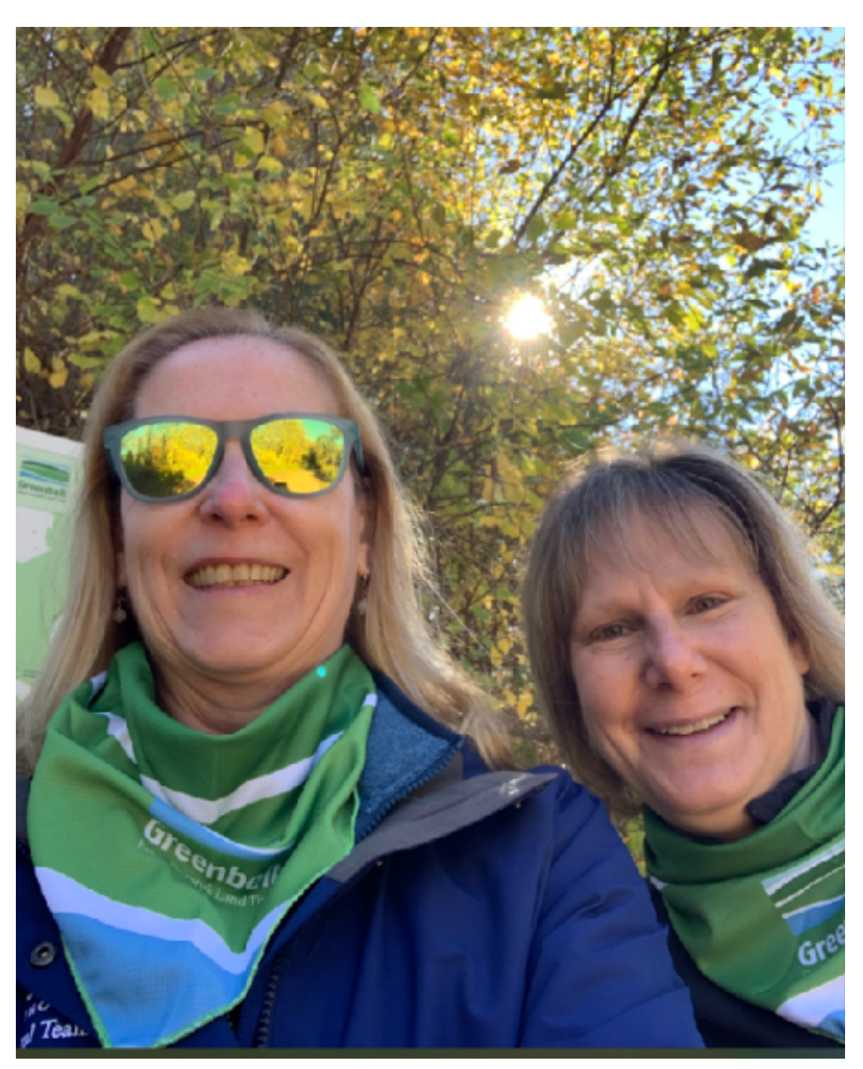
Get Involved with Greenbelt - Volunteer!

Because of the commitment and generosity of many area supporters, 17+ acres in West Gloucester are now conserved. This land encompasses 11.5 acres adjacent to Greenbelt's Great Ledge property, and 6.1 acres on Bray Street near Tompson Street Reservation. Purchased from National Grid, these properties include important natural resources, wildlife habitat, and existing trails. This project successfully came together on a short timeline thanks to all who helped us reach this goal!