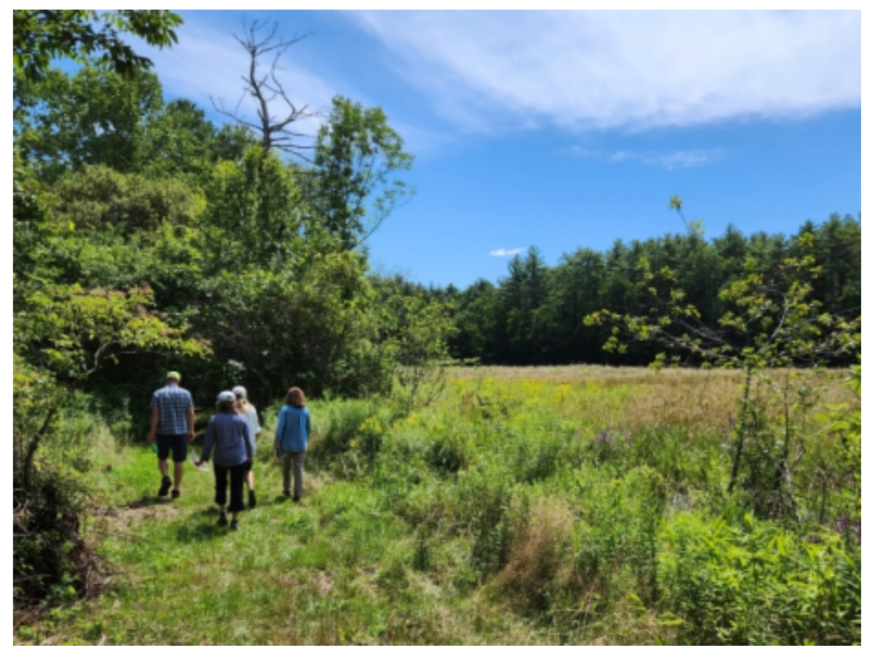
Mount Hunger, Essex and Gloucester