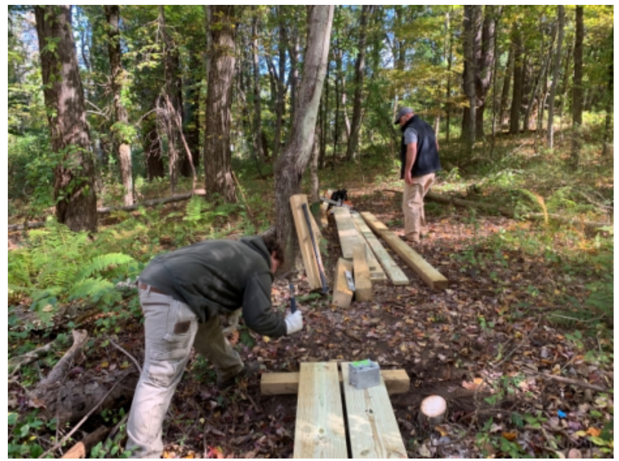
Bridges at River Road, West Newbury