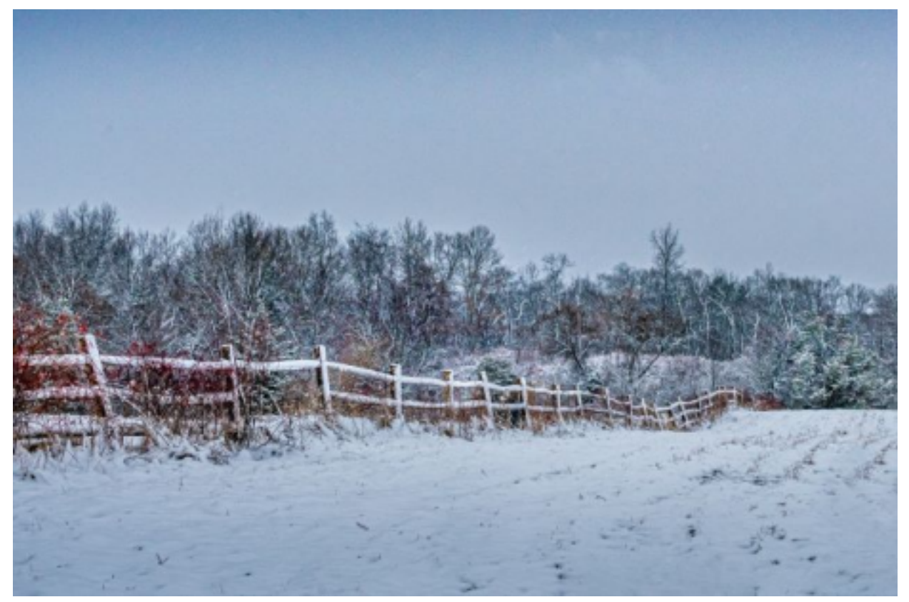
Castle Neck River Reservation, by Neil Ungerleider