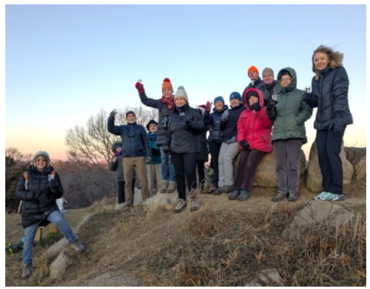
Winter Solstice 2023