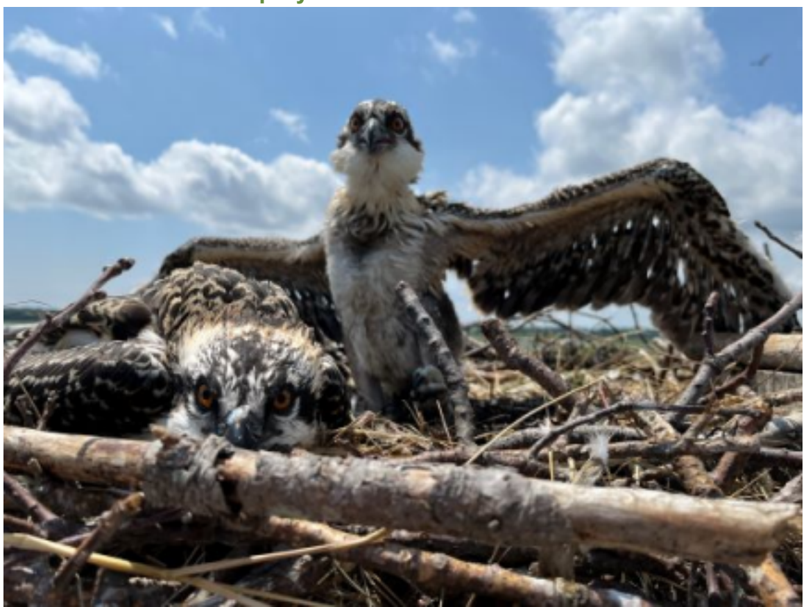
Take a Live Look at Osprey→