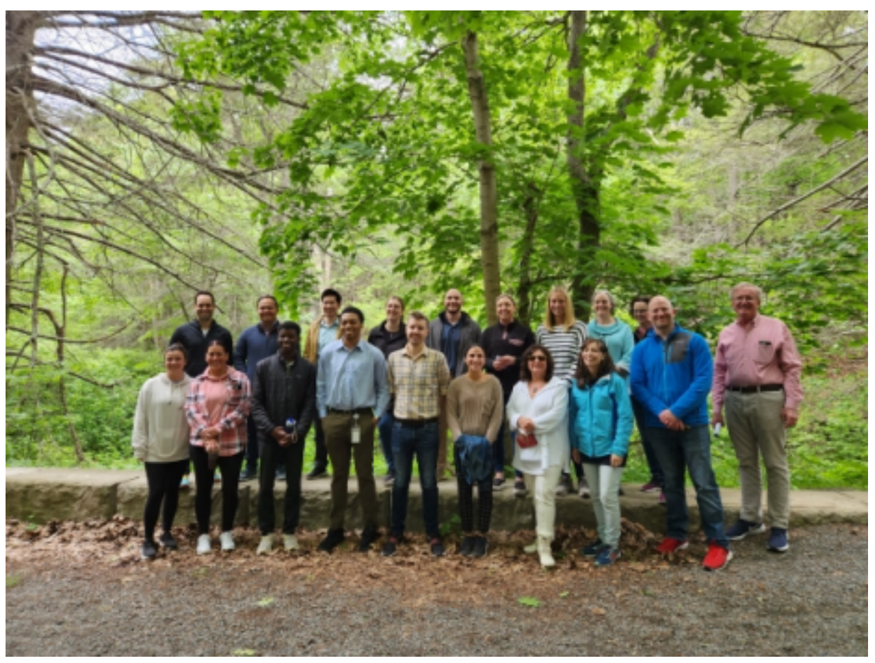
AMG Walk Participants at Beverly Commons, Beverly