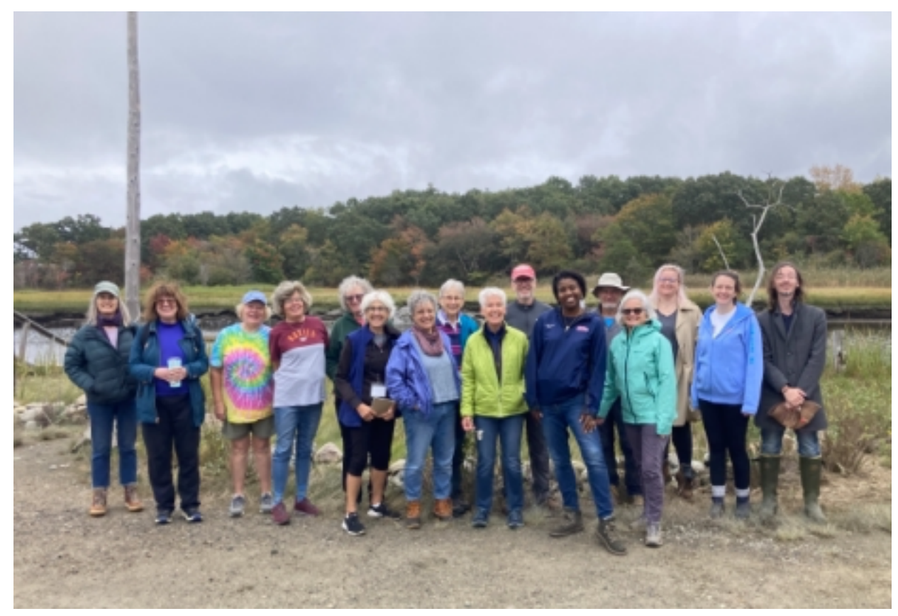
Participants at the Nature Poetry Workshop in Rowley