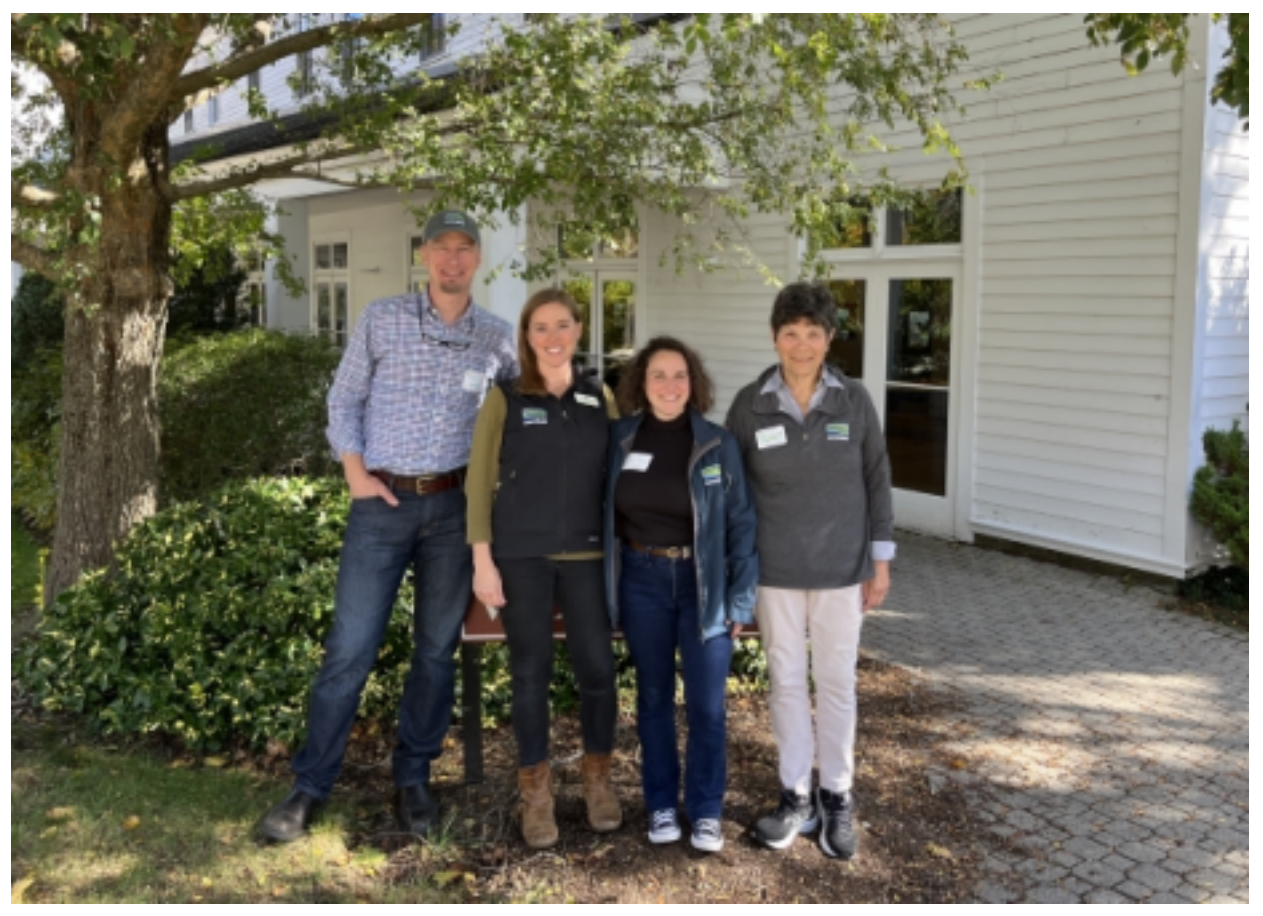
Greenbelt staff attending History & Cultures of the Great Marsh in Byfield